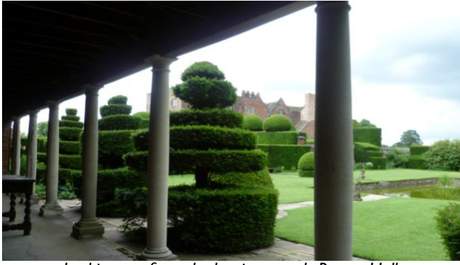
Looking out from the loggia towards Peover Hall