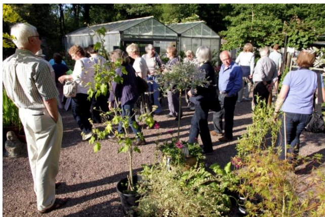
Exploring the nursery

Recently a brick archway has been built to separate the nursery, for which entry is free, from the gardens, where admission must be paid.