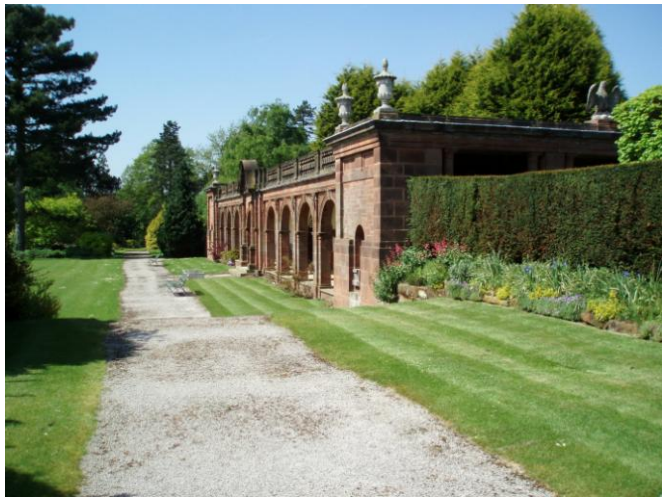
The loggia at Thornton Manor with principal red sandstone facade facing south west beside one of the main walks in the garden

The gardens of Thornton Manor on the Wirral, the former home of Viscount Leverhulme, were laid out predominantly between 1905 and 1914. Their design was the result of collaboration between Thomas Mawson and Leverhulme. Colonnaded garden loggias serve as focal points in the garden, buildings which were designed to enable views out as well as being focal points themselves.