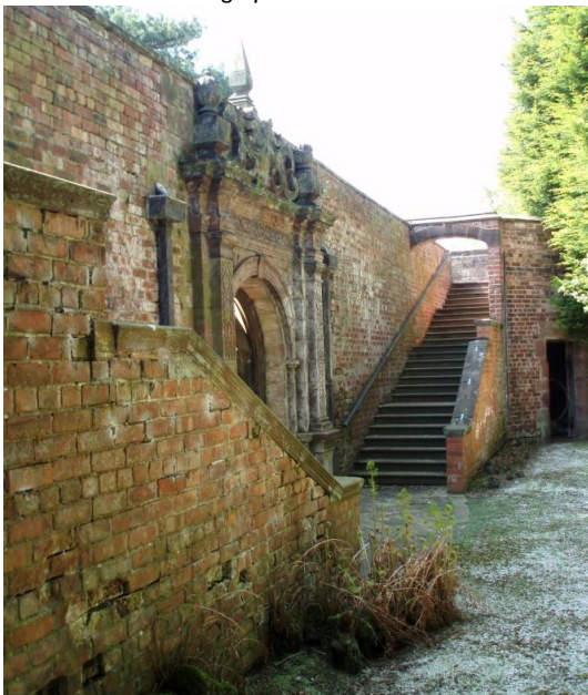
Thornton Manor: The rear elevation of the loggia with flights of stairs onto the roof and a central doorway leading to the kitchen garden

Fig. 154 shows a pavilion, or rather loggia, in the pure Italian style. If glazed, as the sketch shows, it would answer for an orange house, or winter house for half-hardy plants. The casements might be removed in summer, but the side doors should be retained at all seasons, or the thorough draught will be inconvenient.