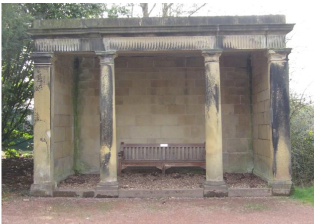
Norton Priory summerhouse

The 18 th century summerhouse at Norton Priory, said to be by James Wyatt, is a simple and classic example of a loggia. Located south of the former hall, it terminated a formal walk between the pleasure grounds and Big Wood. Though the Hall and much of the layout of the grounds have been lost, this building survives as a reminder of more gracious times and aspirations.