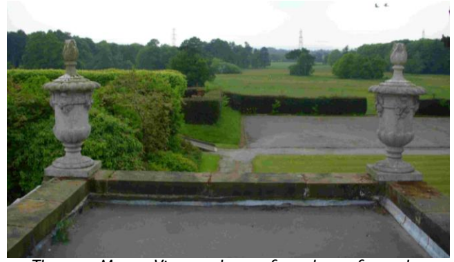
Thornton Manor: View south west from the roof over the garden and parkland towards the Dee estuary and north Wales

The gardens of Thornton Manor on the Wirral, the former home of Viscount Leverhulme, were laid out predominantly between 1905 and 1914. Their design was the result of collaboration between Thomas Mawson and Leverhulme. Colonnaded garden loggias serve as focal points in the garden, buildings which were designed to enable views out as well as being focal points themselves.