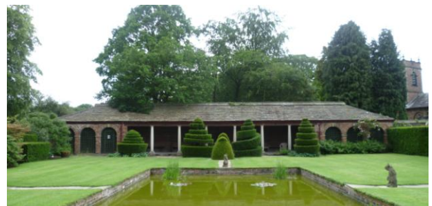
Peover Hall: A view across the Lily Pond garden towards the loggia

The central portion with stone columns is largely unused though it is understood that the gardeners shelter there in inclement weather! The splendid spirally clipped yews in front of the building detract from its function as a loggia but perhaps it was never used to overlook the tranquil lily pond; maybe it was simply an architectural device to enclose and embellish the garden.