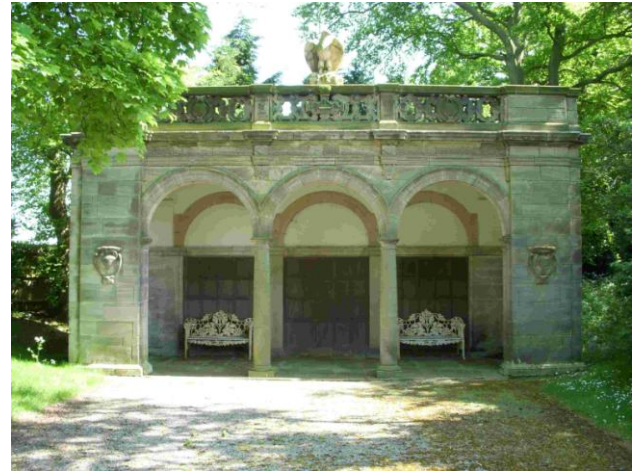
The Tea House at Thornton Manor, in effect a smaller loggia, which terminates the south eastern end of the main terrace