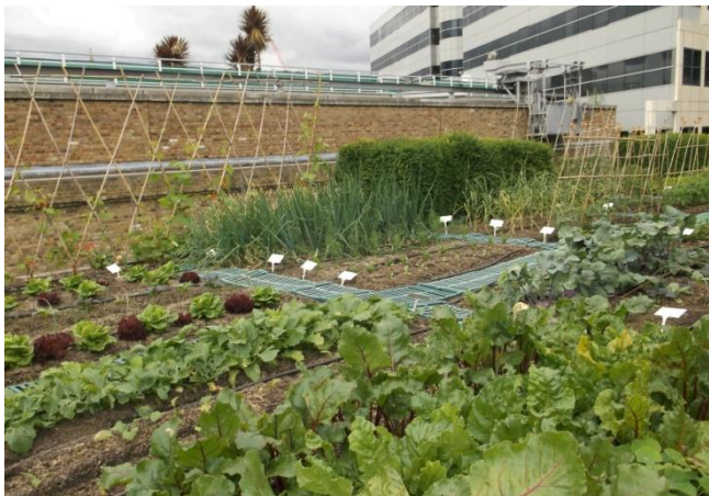
The roof-top vegetable garden at Normura International

As a contrast to the historic gardens and way above the city streets is the garden on the 6th floor roof terrace of Nomura International. This modern garden, with stunning views across and down the river, is maintained by its planners but volunteer employees have created a spotless vegetable garden along the edge by Canon Street Station. No doubt an enterprising snail will reach it one day.