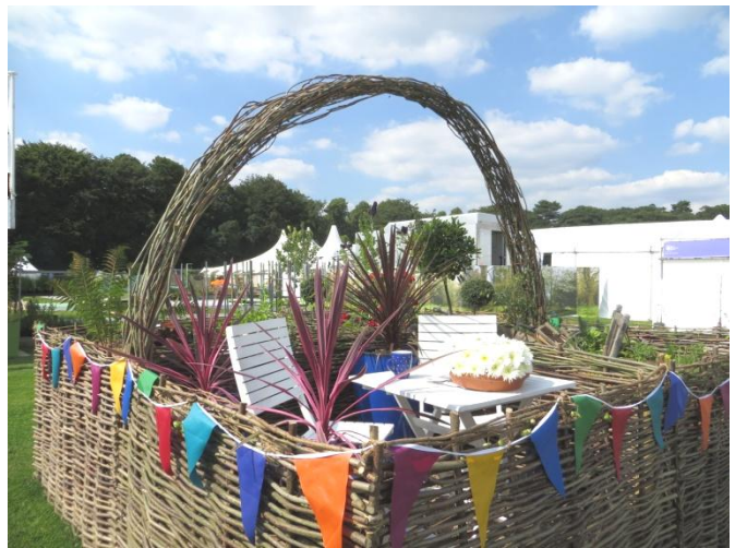
Above: the picnic basket idea was greatly appreciated. In the forefront is the section referencing our visits to modern gardens. Diagonally opposite, was a section with urns and bright red pelargoniums representing the more traditional, historic gardens. One section, with brambles and nettles, represented researching of lost gardens and diagonally opposite that, boxes and other containers of vegetables and herbs, together with an old wheelbarrow and tools represented our Caldwell Project.

There were also exquisitely designed and beautifully executed gardens from Arley Hall and Gardens, Adlington Hall and Gardens, Biddulph Grange, Bluebell Cottage Nursery and Gardens, Cholmondeley Castle Gardens, Fryers Garden Centre and Norton Priory