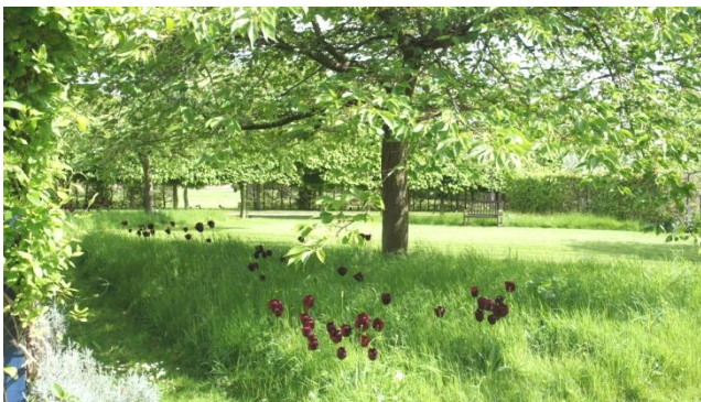
Above: the Square garden with tulips in flower

It is entered from the holiday cottage stable block through a pleached hornbeam hedge with arches leading, on the right to a large open space with beech and lavender hedging and a south facing Mediterranean border. To the left an arch leads first to the Circular garden with herbaceous borders in blue white and silver. The Square garden was created as a seating area for guests and it is at its best when spring bulbs are in flower. The Triangular garden features rose beds.