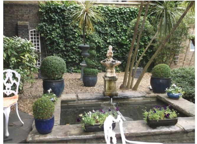
The garden at the Academy Hotel

Another private space, or spaces, were the two small, secluded, courtyard gardens of The Academy Hotel. In one it was possible to enjoy wine or coffee by a pool, a privilege usually reserved for guests.